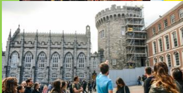
SANDEMANs NEW Dublin, Free Walking Tour