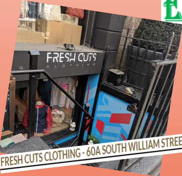
FRESH CUTS CLOTHING - 60A SOUTH WILLIAM STREET