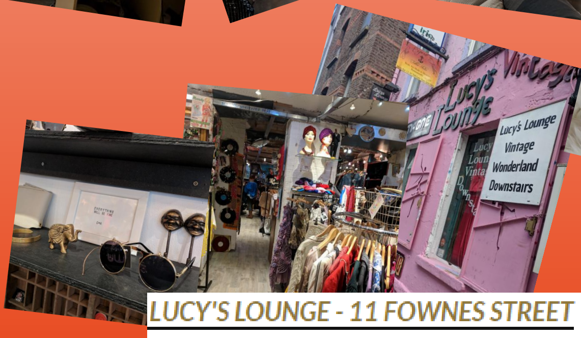
LUCY'S LOUNGE - 11 FOWNES STREET