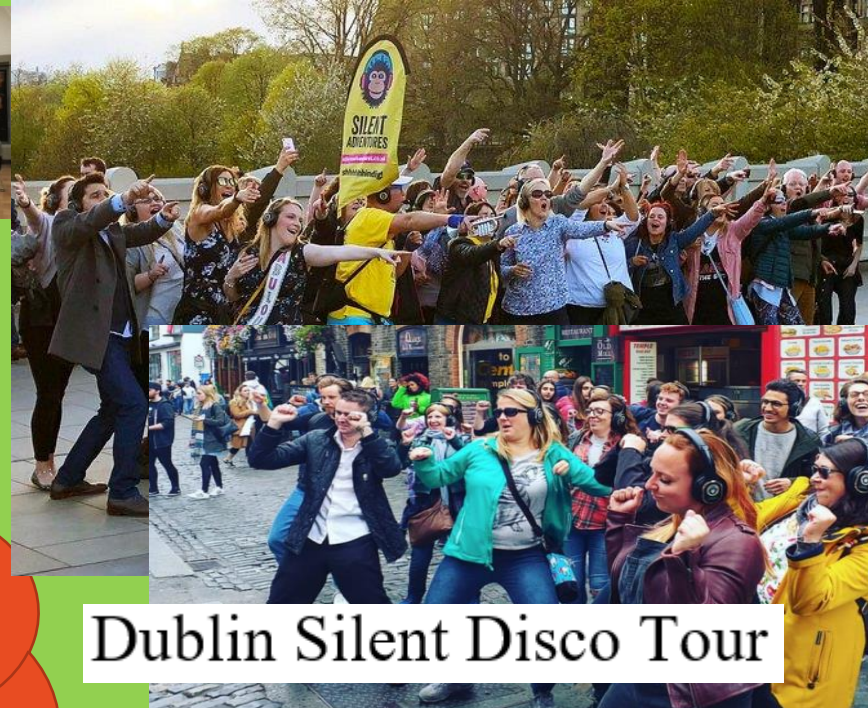
Dublin Silent Disco Tour