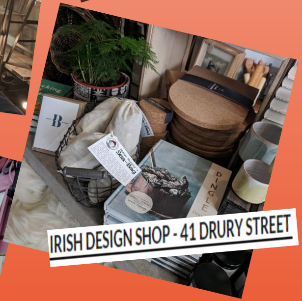
IRISH DESIGN SHOP - 41 DRURY STREET