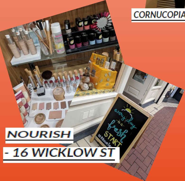
NOURISH - 16 WICKLOW ST