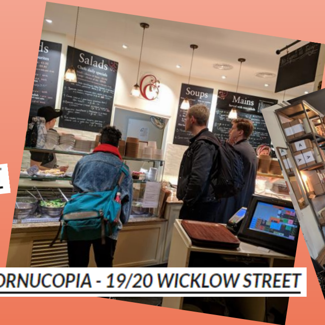
CORNUCOPIA - 19/20 WICKLOW STREET