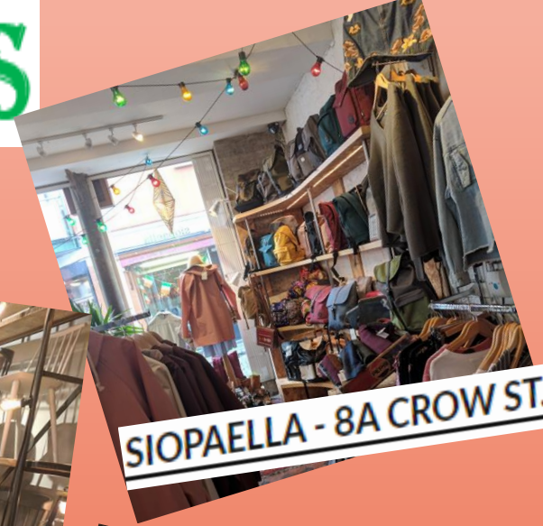
SIOPAELLA - 8A CROW ST