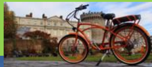
See Dublin By Bike